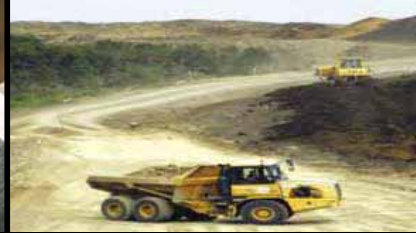
A road building project in the Eastern Cape. The development of artisan and technical skills for infrastructure development is a medium to longer-term objective of JIPSA.