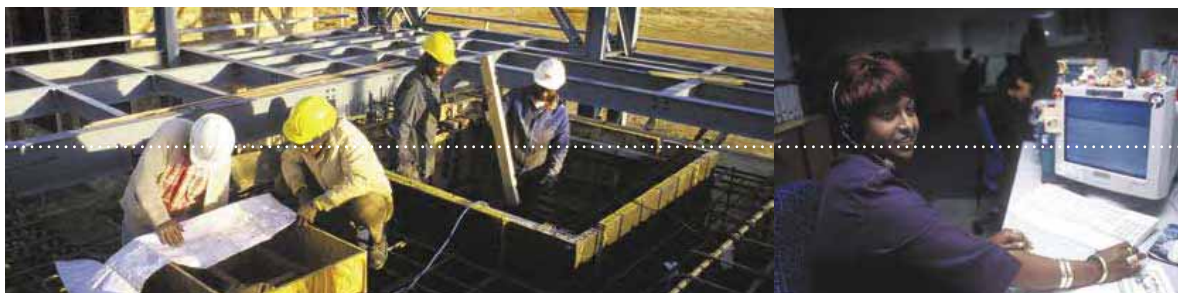
A construction site at a mine in the Free State. The development of artisan and technical skills for infrastructure development is a medium to longer-term objective of JIPSA. The development of ICT skills is one of JIPSA's short-term objectives.