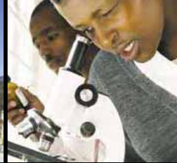
Learners participate in a science class at Kollifve Sangeni High. Science competence in public schooling is one of JIPSA's medium to longer-term objectives.