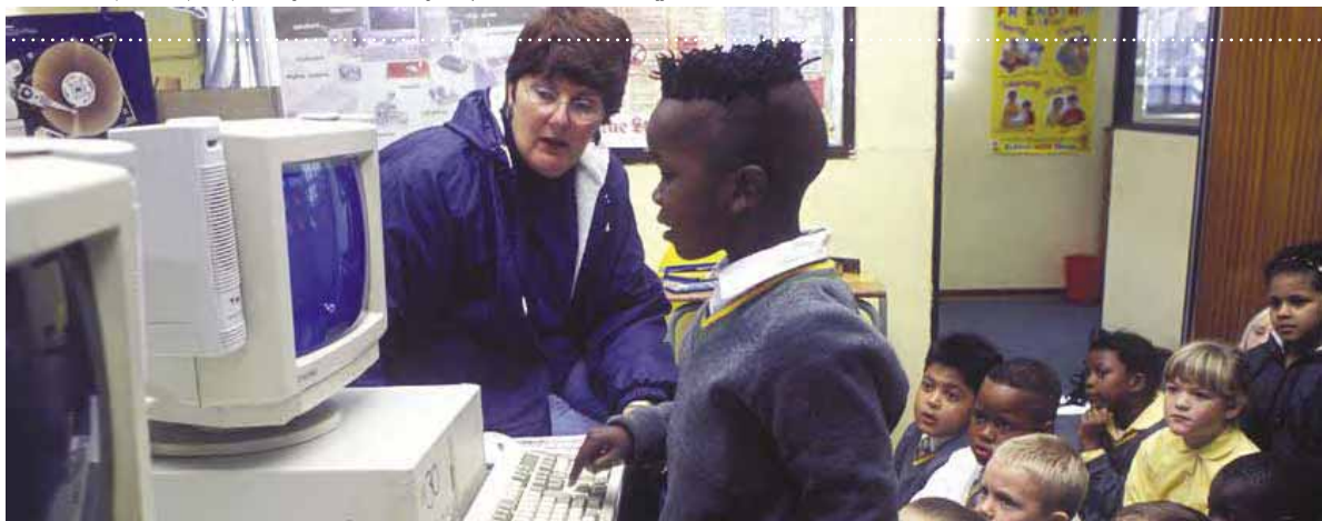
The development of ICT competence in public schooling is one of JIPSA's medium to longer-term objectives.