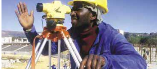
A surveyor works at the construction of the Bafokeng Stadium in Rustenburg. The acquisition of intermediate artisan and technical skills for infrastructure development is a short-term objective of JIPSA.